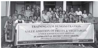
SUMMIT REPORT GANGTOK, 27 JUL:

One day Training programme cum Demonstration on Value Addition of locally available fruits and vegetables was organised by Krishi Vigyan Kendra in collaboration with ATMA, West Sikkim under Krishi Kalyan Abhiyan in Malbasey, West Sikkim, as per a press release.