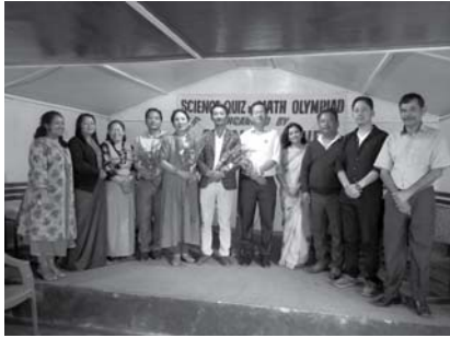
SUMMIT REPORT GANGTOK, 27 JUL: