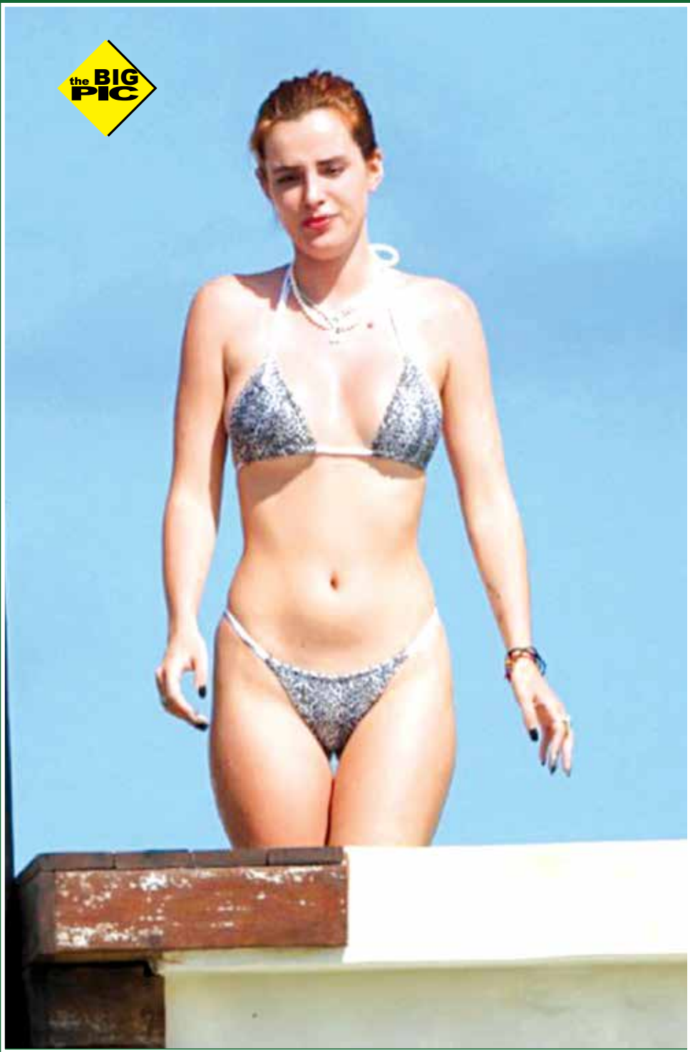
BIKINI BODY! Actress Bella Thorne showed off her curves in an animal-print bikini as she hung out by the pool in Tulum, Mexico, with boyfriend Benjamin Mascolo.

"Tandav" will hit the streaming platform on January 15.