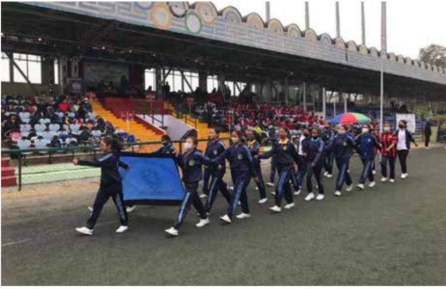
table tennis, taekwondo and karate, while athletics will be held at Khel Gaon, Reshithang, archery at Archery Field, Tathangchen and boxing in White Hall complex. The closing function of the competition will be held on 01 March.

The competition has eight sports disciplines for U-17 boys and girls and six disciplines for U-14 boys and girls at different venues in the capital. Paljor Stadium complex will host events of badminton, football,