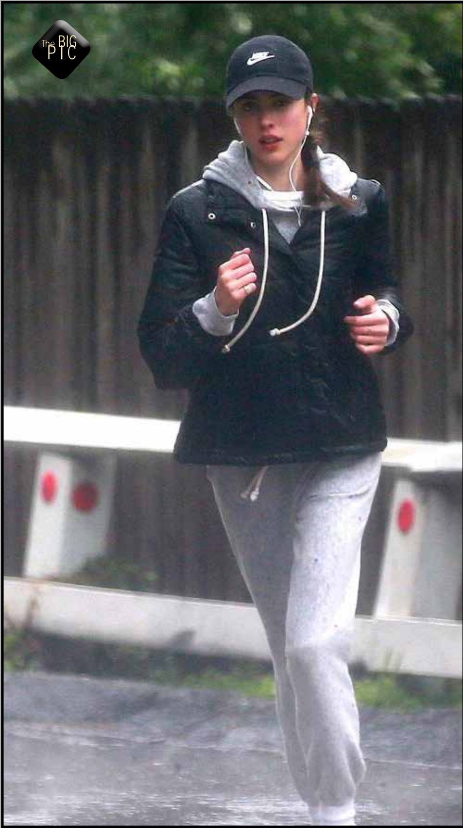
TIME FOR A JOG! The actress, Margaret Qualley gets in her daily exercise despite the rainy weather in Los Angeles.

A ceremony to mourn his death was being planned, according to Japanese media, but details were not immediately available. The Tokyo city and central government have requested that public gatherings are avoided because of the pandemic.