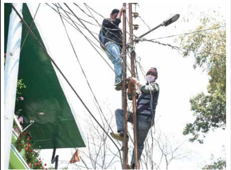
POWER DEPT STAFF AT WORK

"So entrepreneurs in northeast, especially young ones, can really do a lot because just like cricket is to other parts of the country, football is the sport in the northeast.