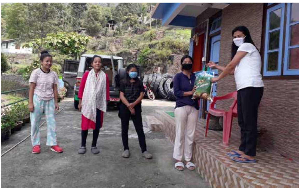
Anganwadi workers of Singtam Rural Project East Sikkim under Social Justice & Welfare Department ensure timely distribution of ration to beneficiaries during lockdown.

Energy and Power Department staff of Namchi works diligently amidst the lockdown.