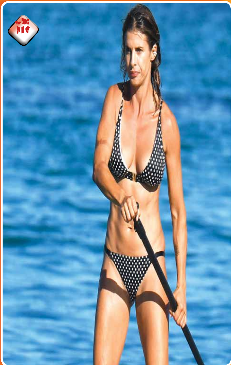
DOG PADDLE! Actress Elisabetta Canalis brought her pooch when she went paddle-boarding in Sardinia.