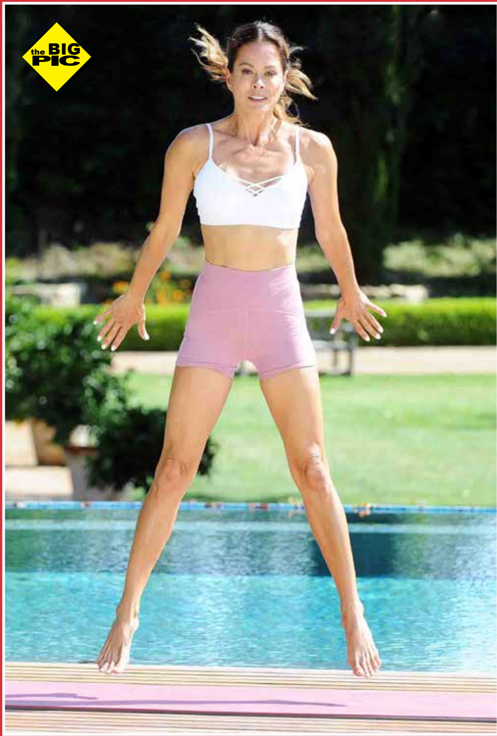
CATCHING AIR! Actress Brooke Burke taped segments for her Brooke Burke Body app at home in Malibu, California.