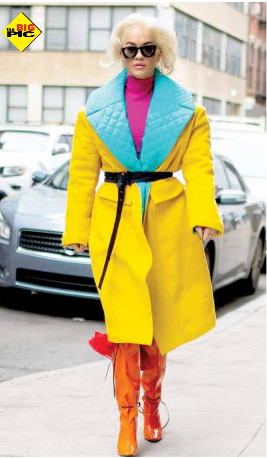
QUEEN OF COLOR-BLOCKING! The “Girls” singer, Rita Ora rocks a bright ensemble while out on a press day in NYC.