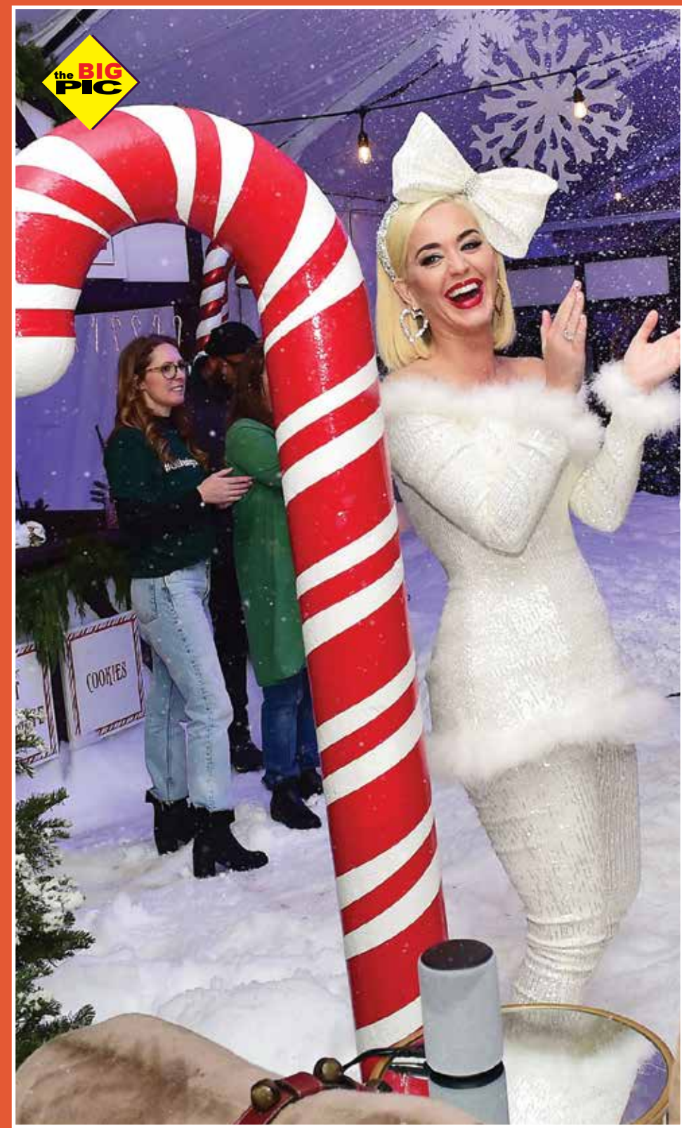
CHRISTMAS WITH KATY! Singer, Katy Perry joined Amazon in Delivering Smiles this holiday season at Boys & Girls Clubs of metro Los Angeles – Bell Gardens Clubhouse.

The reported budget on "Tenet" is over $220 million, which would make it the most expensive original film of Nolan's career so far. The filmmaker earned some of his best reviews yet with his last feature, the WWII survival thriller "Dunkirk." The drama grossed $526 million worldwide and earned eight Oscar nominations and three wins: Best Sound Editing, Best Sound Mixing, and Best Film Editing.