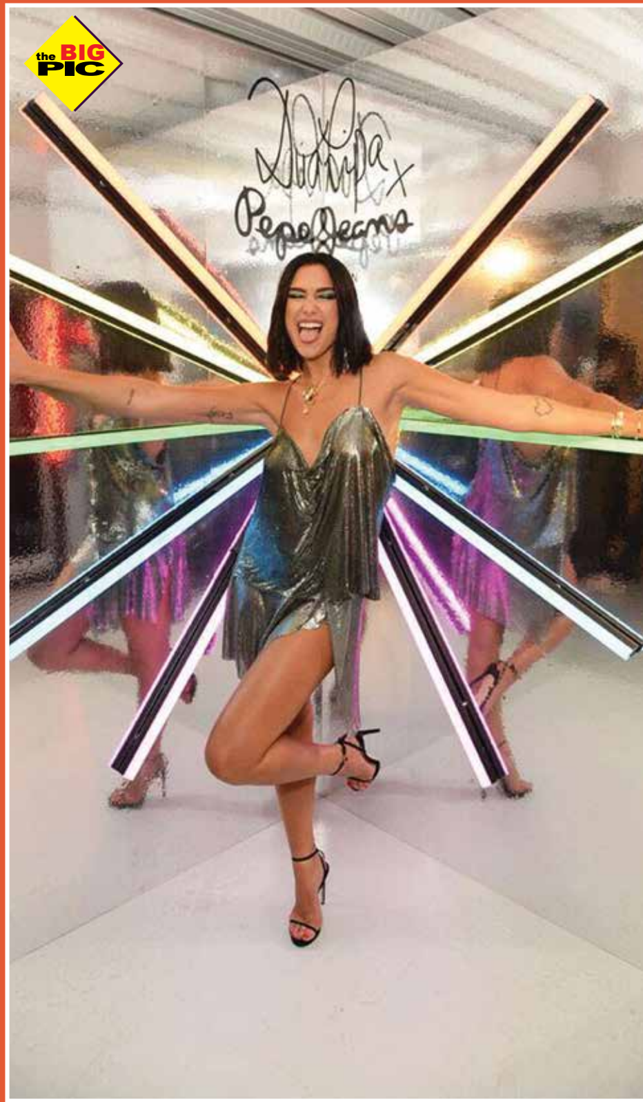
BEAM IN COLORS! The “New Rules” singer, Dua Lipa shows good vibes as she celebrates her Pepe official collection launch in London.