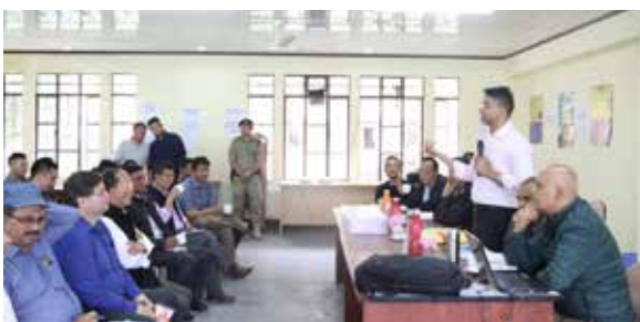
table + one postal ballot table + one for computation or returning officer table to witness the counting process for Assembly Constituencies.

Each candidate shall be allowed to appoint 8 numbers of counting agents; 6 for counting