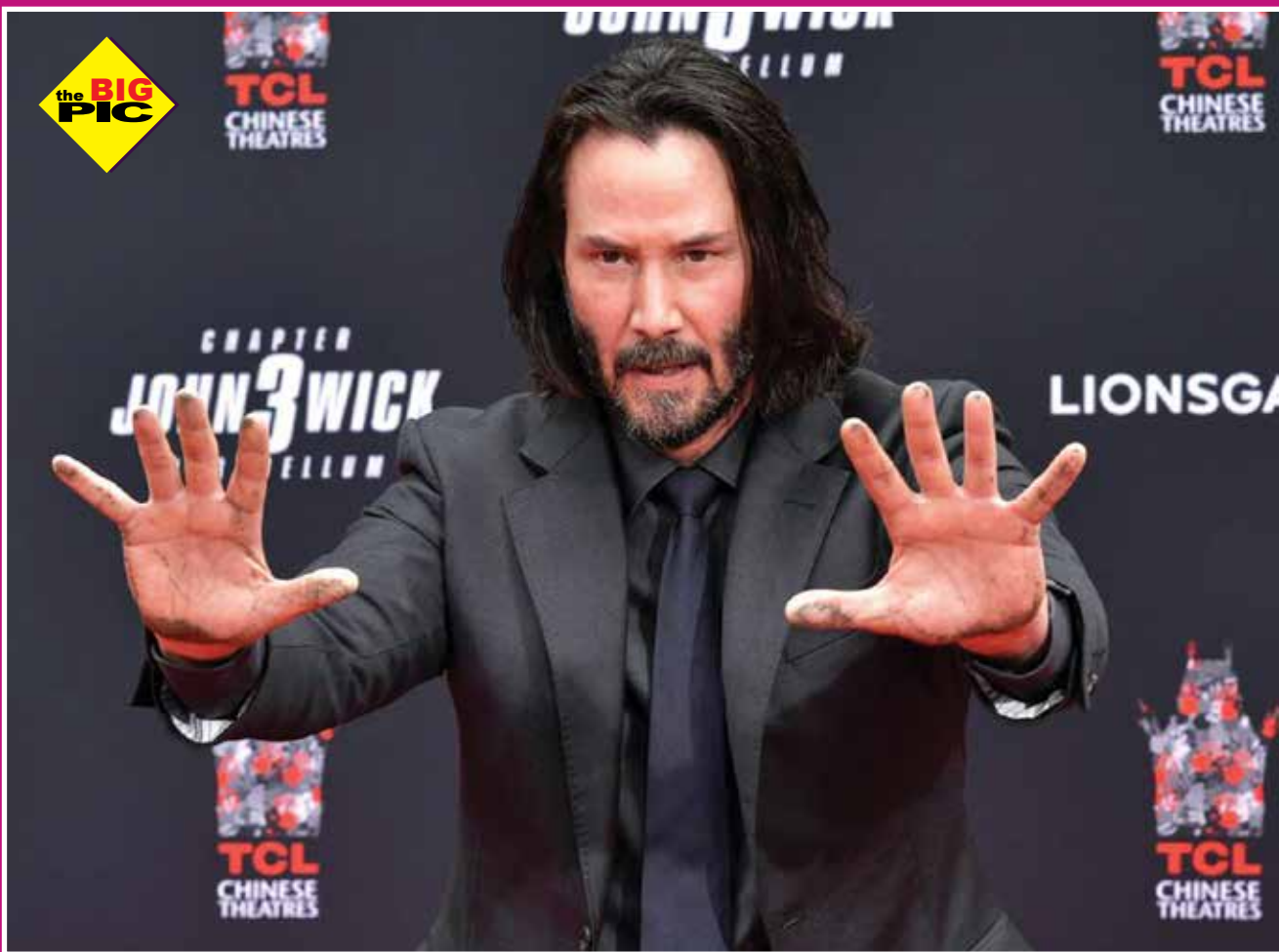
THE ONE! The John Wick actor, Keanu Reeves shows off some Matrix moves as he is honored with a handprint ceremony at the Chinese Theatre in Hollywood.