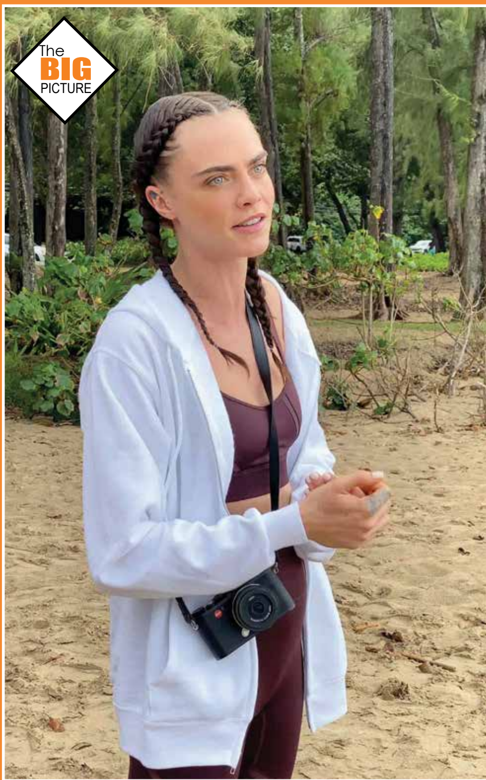
GETTING INVOLVED! Model Cara Delevingne cleaned up the beach in Hawaii.

For her part, Clarkson is required to pay nearly $200,000 per month to Blackstock, a former music manager, in spousal and child support. He is responsible for "100% of the cost" of transporting their two children (River, 7, and Remington, 5) to and from Montana. He has a 25 percent custodial timeshare.