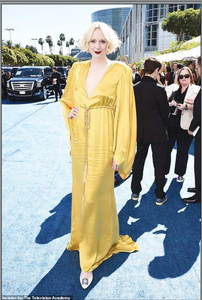
Invasion for The Television Academy

YELLOW THERE! Gwendoline Christie, 39, showcased her statuesque frame in a striking yellow silk gown for the 70th Annual Emmy Awards at the Microsoft Theatre on Los Angeles.