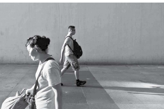
On average, women tend to behave more submissively than men.

With exception to the recent fame of the lobster as the poster child of social climbers, the most commonly known example of dominance hierarchies is probably the pecking order of domestic