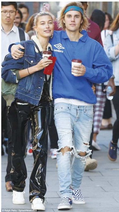
TMZ also said Justin was 'emotional' when he got his marriage license.

A source added to the site that last month they had pushed their wedding to 2019 but they later had a 'change of heart' and want to marry in mid September.