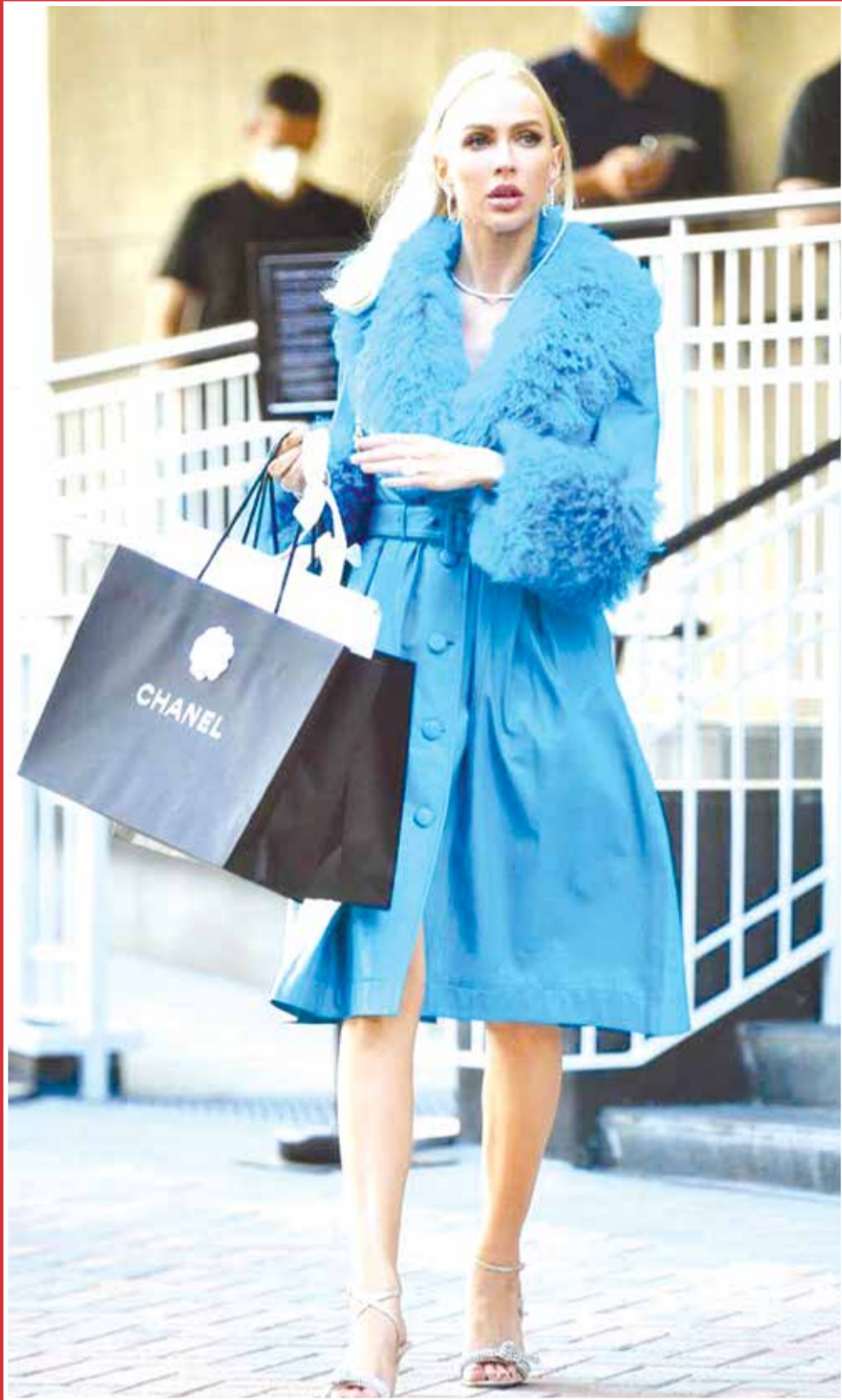
LUXE SHOPPING! The Selling Sunset star, Christine Quinn leaves the Beverly Hills Chanel store in a bright blue Sherling coat.