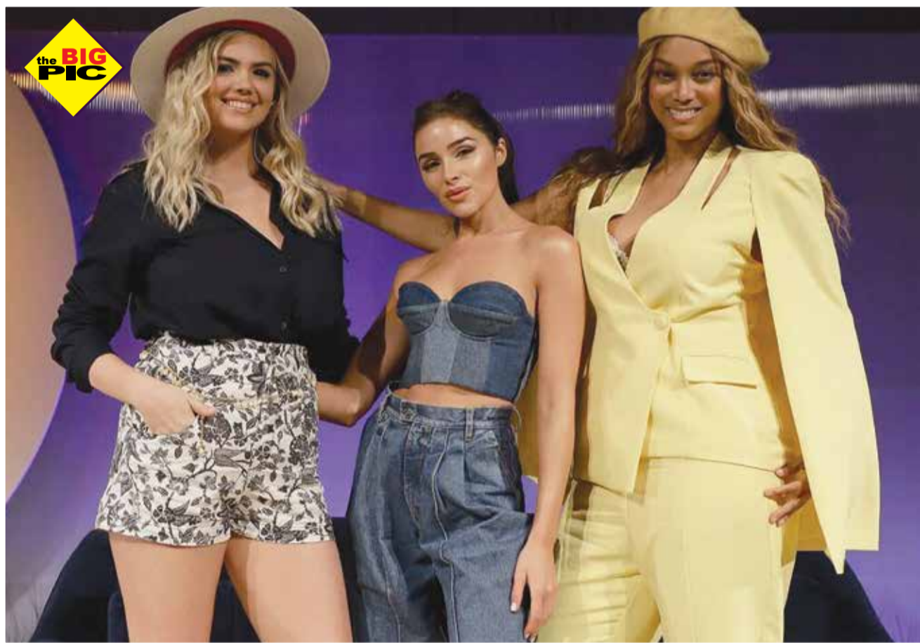
The models, Kate Upton, Olivia Culpo, & Tyra Banks attend the Sports Illustrated Swimsuit On Location event in Miami.

"Little Big Shots" last aired in July 2018 and is scheduled to return to NBC next winter.