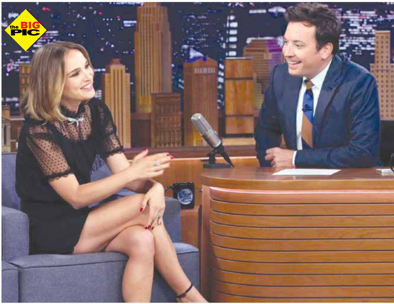
THE TALK! The actress, Natalie Portman sat down with the talk show host, Jimmy Fallon and shared a few laughs during her interview.