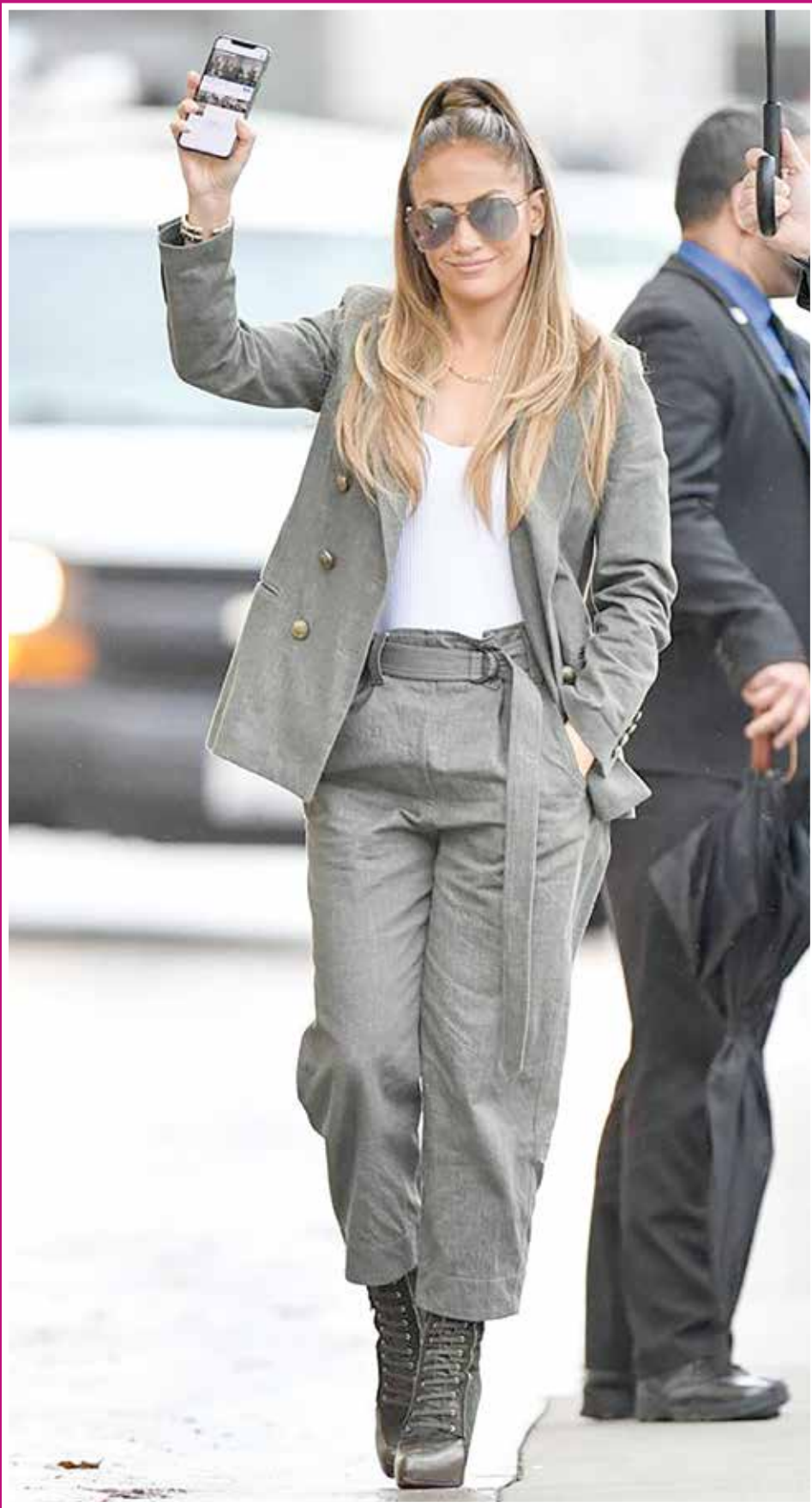
HELLO, J LO! The Second Act star, Jennifer Lopez, waves to the cameras before heading into Jimmy Kimmel Live! in Los Angeles.