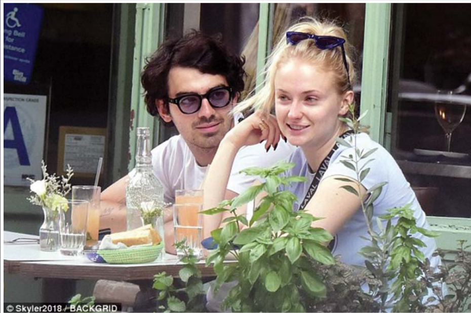
LOVE BIRDS! Sophie Turner, 22, and Joe Jonas, 28, looked as loved up as ever as they enjoyed a romantic lunch date in NYC.