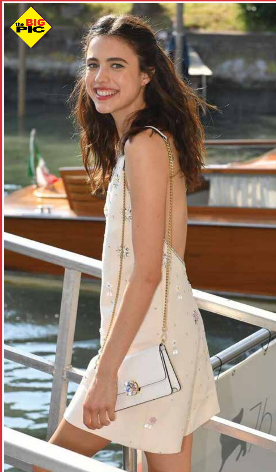
LUMINOUS GIRL! The actress, Margaret Qualley glows as she gets on a water taxi in Venice, Italy.

"We try to hire mostly female directors. There are so many out there that are talented and we don't have space for them all. It's the same with cinematographers. They are out there. I think there's an awakening and a realisation of the inequality and a necessity rising in people to fix that, which is good," the actor said.