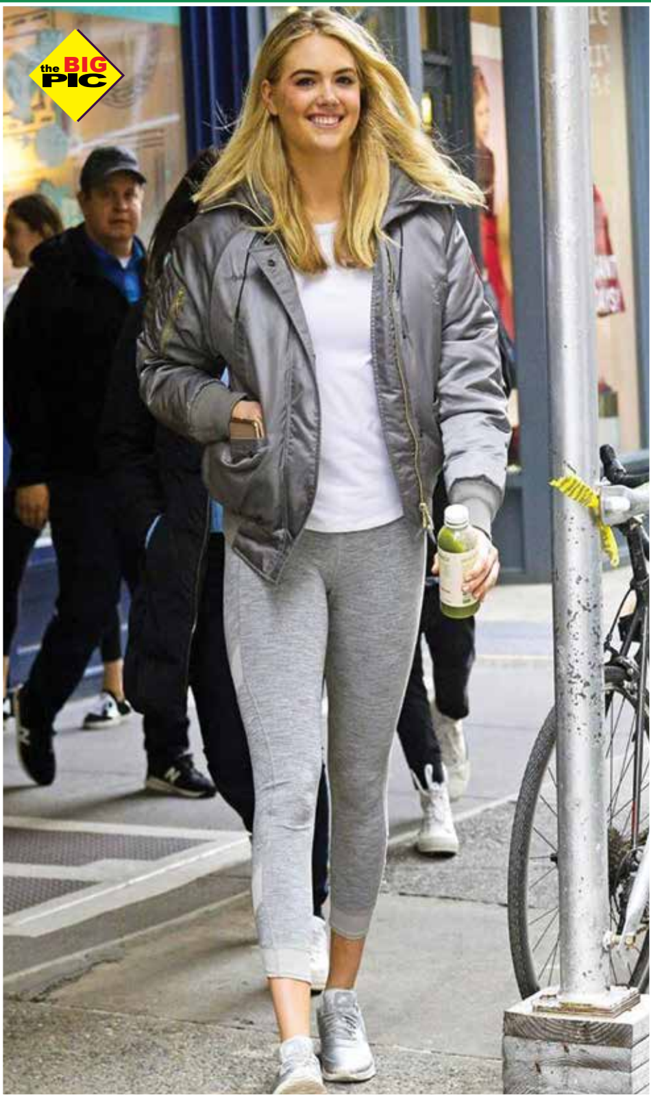
CASUAL CUTIE! The model, Kate Upton steps out wearing workout gear and a big smile in The Big Apple.