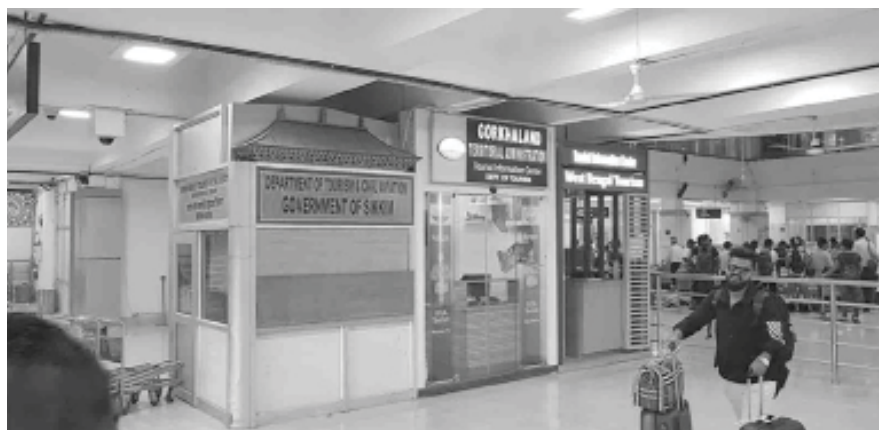
This photo was posted on 22nd July, 2018, Courtesy: Friends FB page.

Initially, after seeing the photo, the first kind of mindboggling contradiction came up and I had a second thought that may be Tourism Department has opened its other stall in some railway station. Suddenly I noticed the stall of