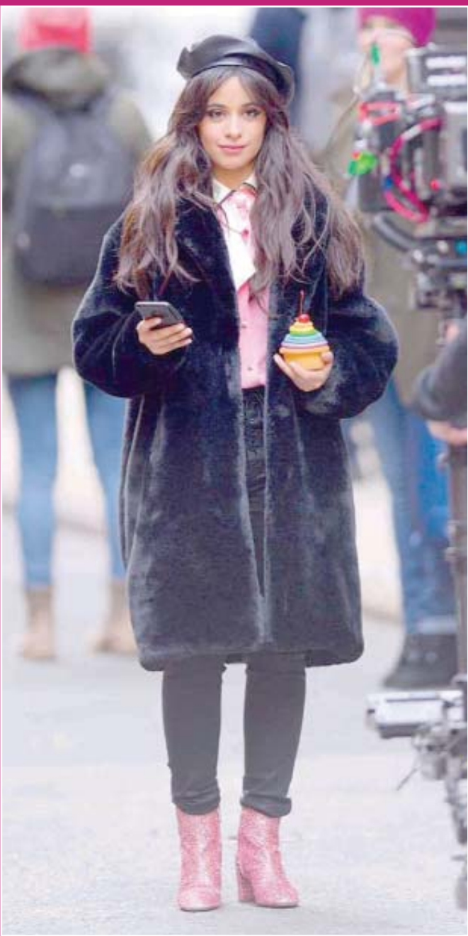
STYLISH AND WARM: THE 'HAVANA' SINGER, CAMILA CABELLO, WAS SEEN FILMING A COMMERCIAL IN MANHATTAN LOOKING STYLISH AND WARM WHILE HOLDING A CUPCAKE.