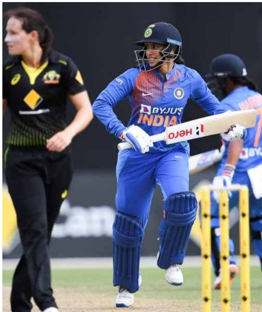
When Mithali started out in 1999, women's cricket was almost an unknown entity, a far cry

Female stars emerging as role models has been the "biggest change" in women's cricket's journey from near-anonymity to stardom, feels Mithali, who grew up idolising her male counterparts.