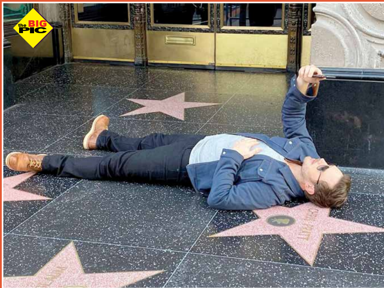
STARSTRUCK SELF! The actor, Chris Pratt is seen posing with his Hollywood Star while out on the Walk of Fame in Los Angeles.