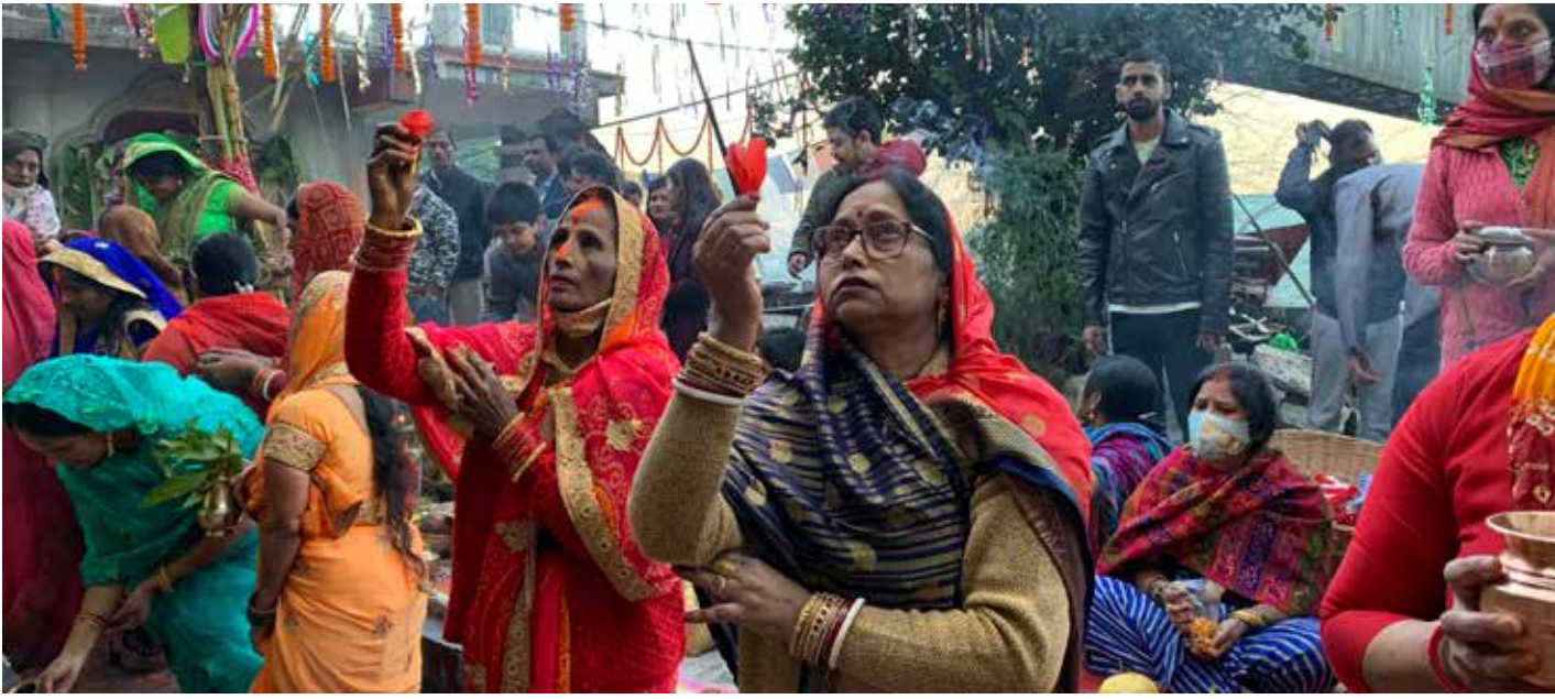
On the last day of Chhath Puja, devotees made offerings to the rising sun, as can be seen in pic above of prayers at the Durga Mandir at Tadong. With these offerings, devotees ended their 36-hour fast, after which Prasad, of which Thekuwa is the clear favourite, was shared and distributed.