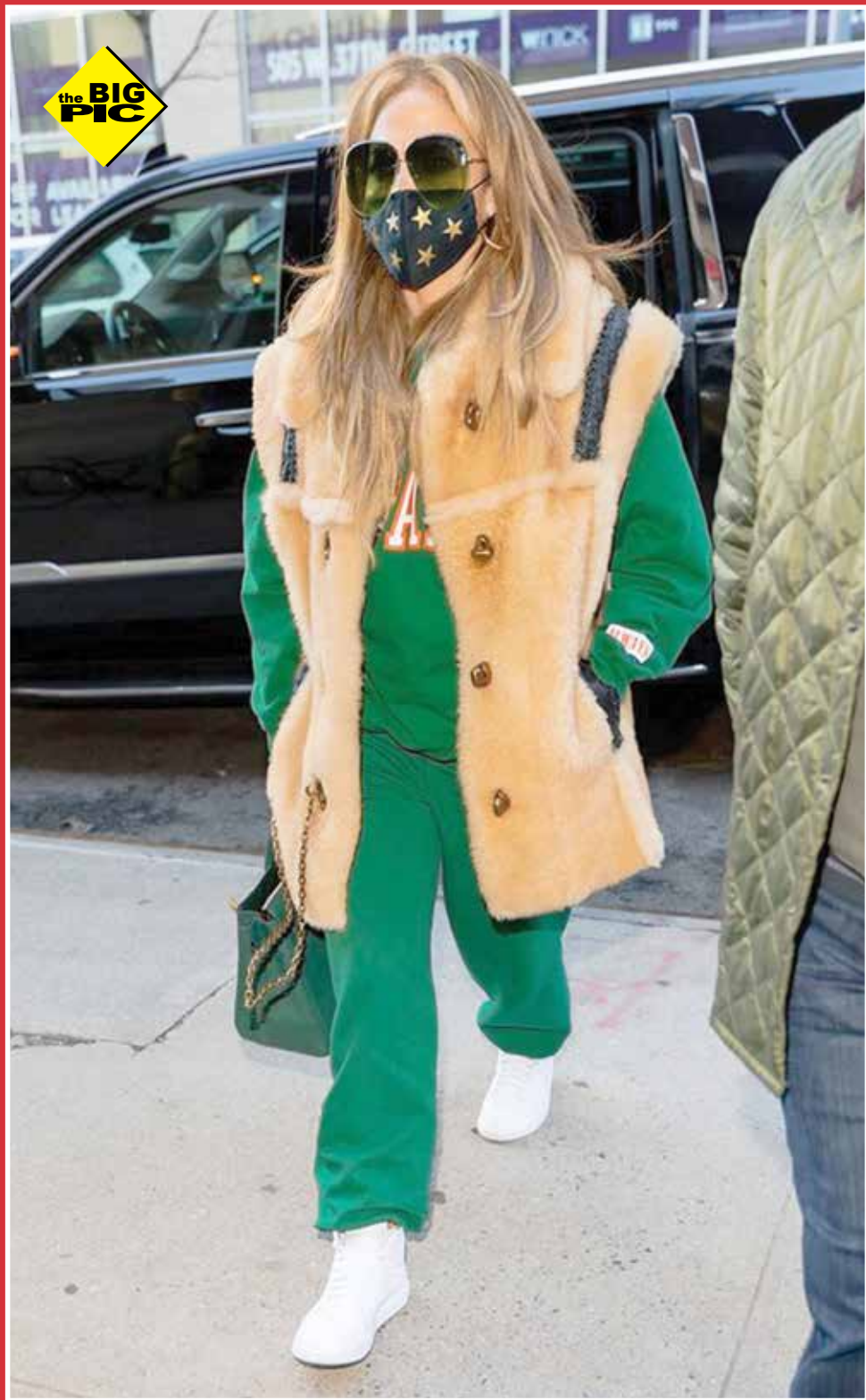
ON THE GO! The singer and performer, Jennifer Lopez wears a green sweatsuit and white sneakers under a fuzzy coat vest while out in NYC.