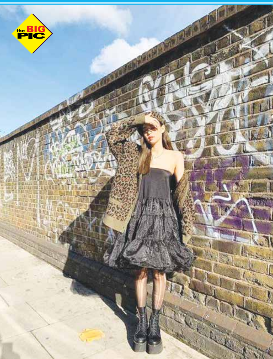
ANIMAL INSTINCT: Proving to be the fashionista that she is, Korean star, Jennie, wears an oversized leopard print cardigan with a knit leopard print beanie with a gothic looking tiered dress and combat boots.