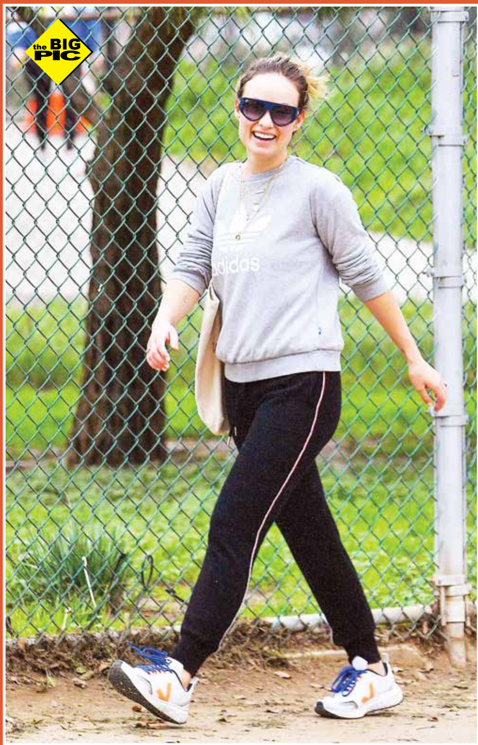
OUT AND ABOUT! Actress, Olivia Wilde showed off her pearly whites while going for a walk in Los Angeles.