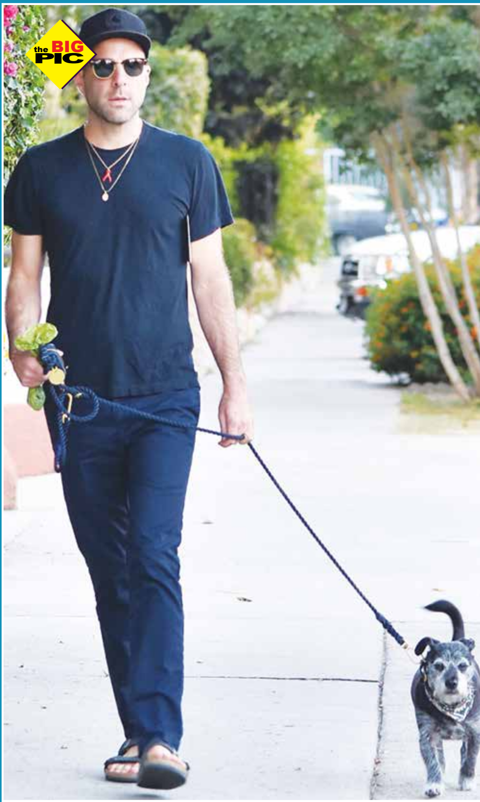
Best pals! The actor, Zachary Quinto takes a stroll with his dog in Los Angeles.