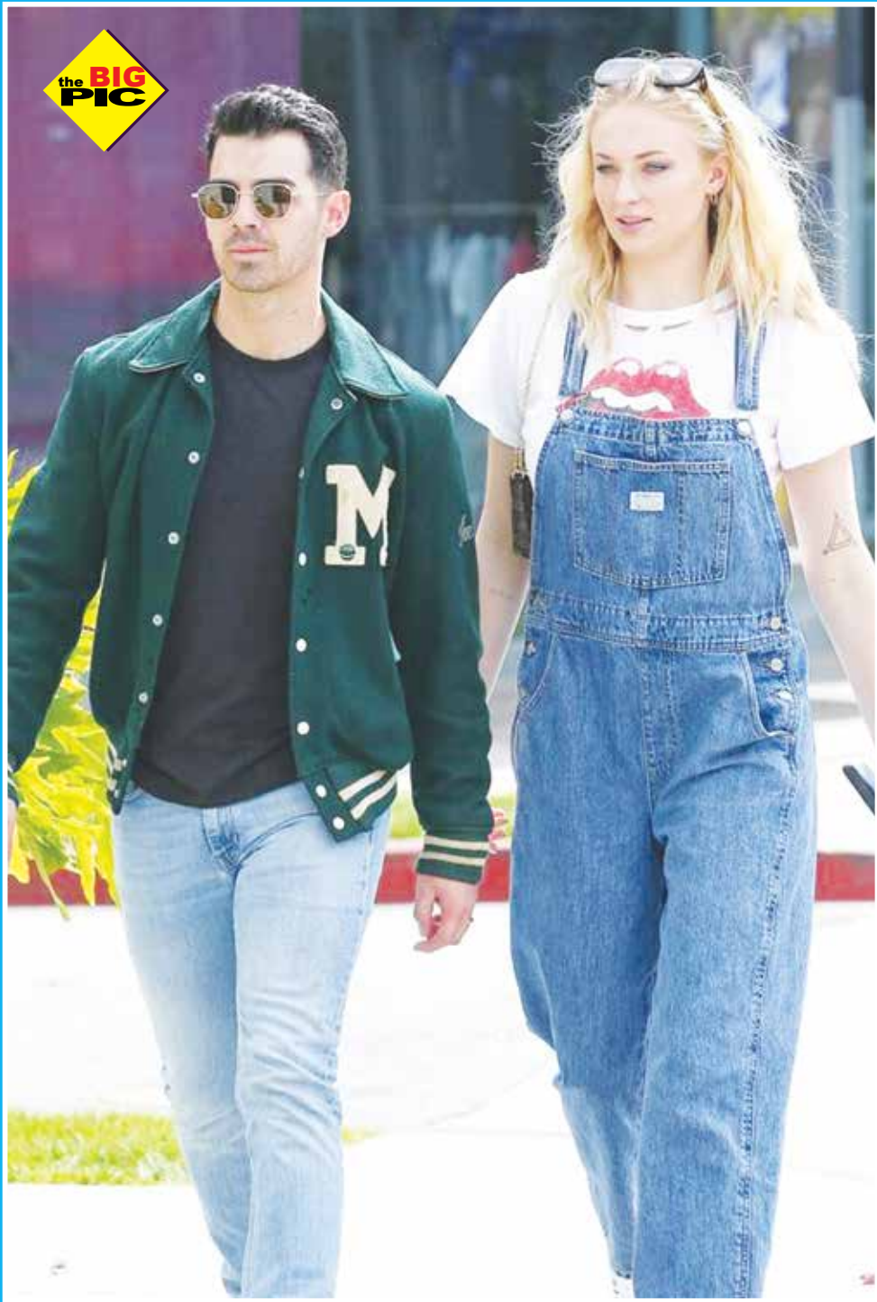
DENIM DUO! Joe Jonas & Sophie Turner, the singer and Game of Thrones actress, step out for smoothies on a sunny afternoon in Los Angeles.