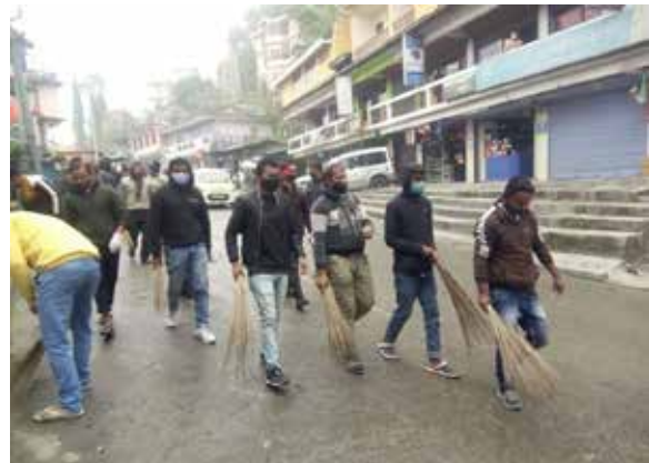
personnel, members of the business community,