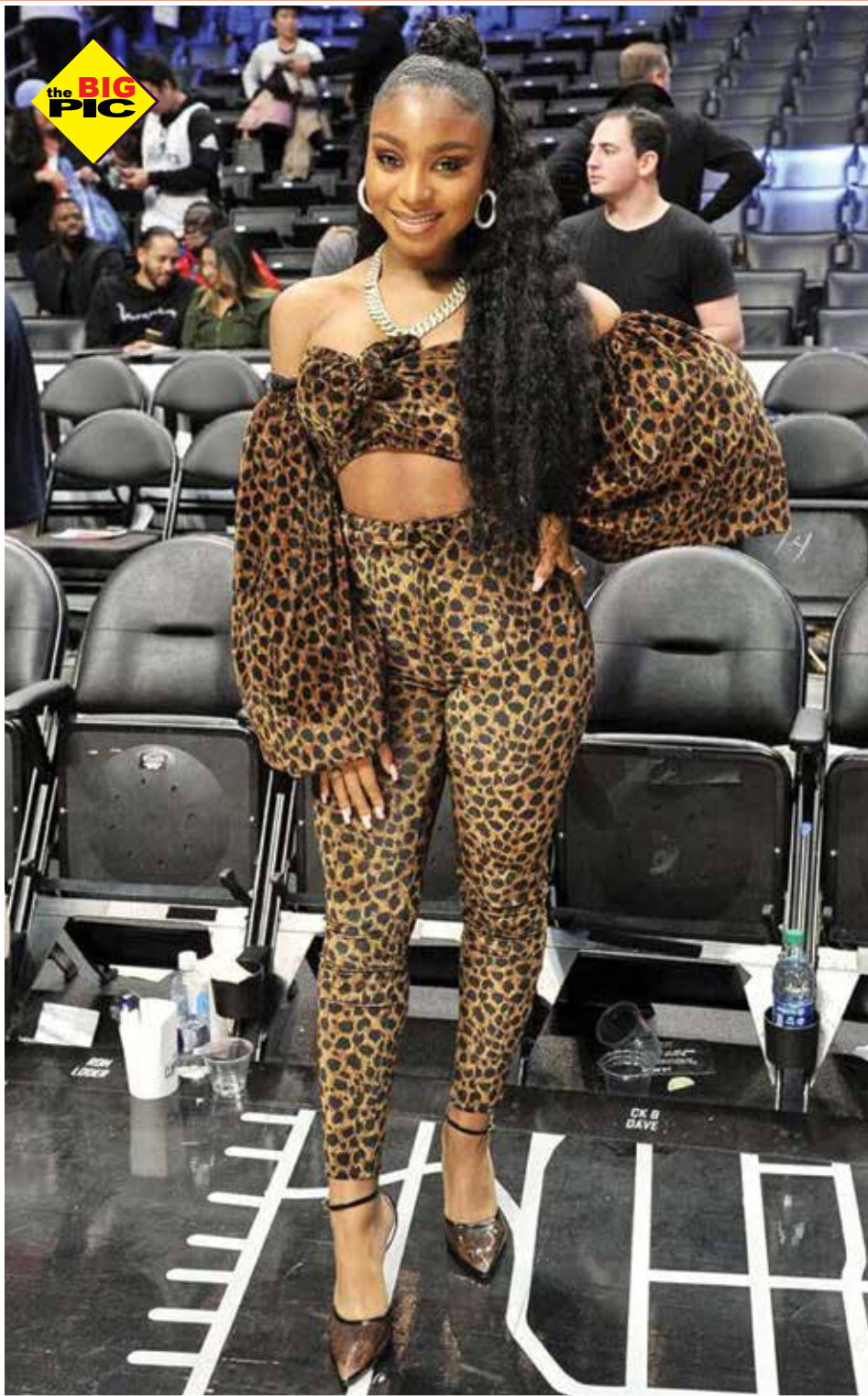
WILD LOOKS! The “Motivation” singer, Normani poses in a leopard print ensemble at the Los Angeles Clippers and Portland Trailblazers basketball game.