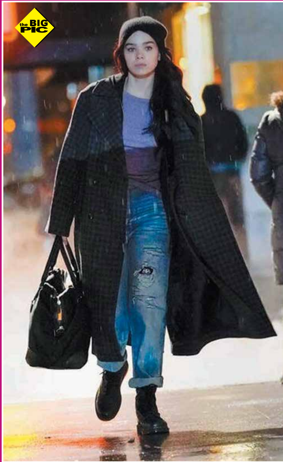
RAINY NIGHT! Actress Hailee Steinfeld on the set of Hawkeye in New York City.