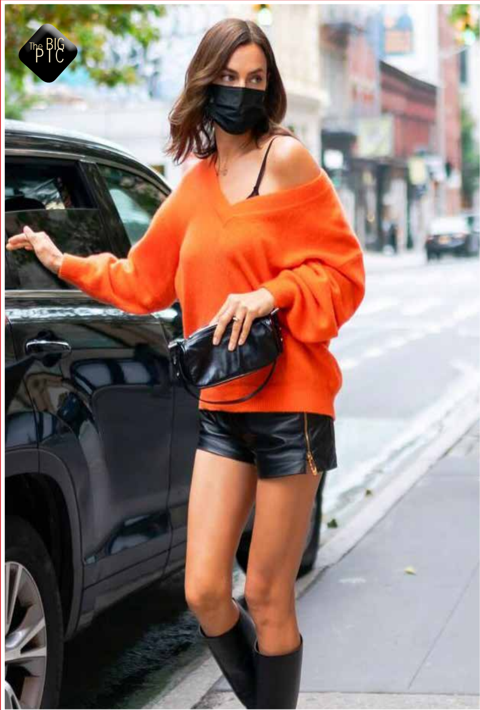
LEATHER GAME! The model, Irina Shayk stuns in an orange sweater and matching leather shorts, purse, and boots while out in NYC.