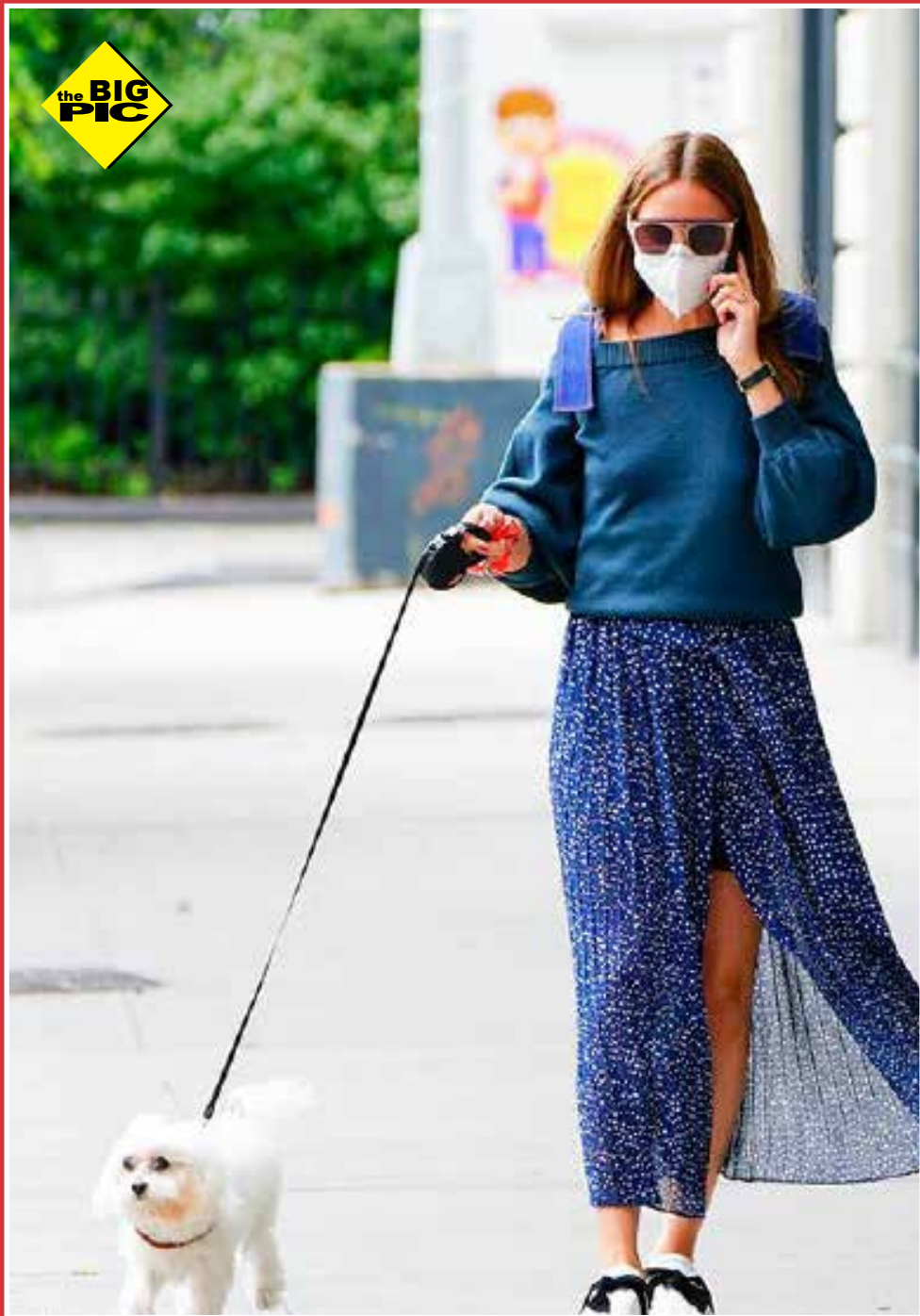
STYLISH WALK! The fashion guru, Olivia Palermo takes her cute pup out for a walk in Brooklyn, NY.