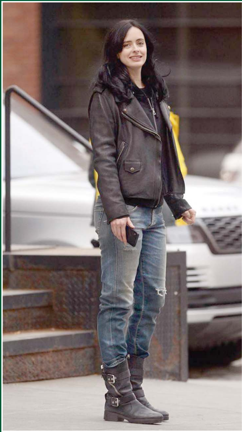
SMILES FOR MILES! Jessica Jones actress, Krysten Ritter, is all smiles while filming in New York City today.