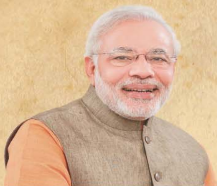
Narendra Modi Prime Minister

"When the intent is good, when the intent is clean and when policies are clear then even the most difficult goals can be achieved"