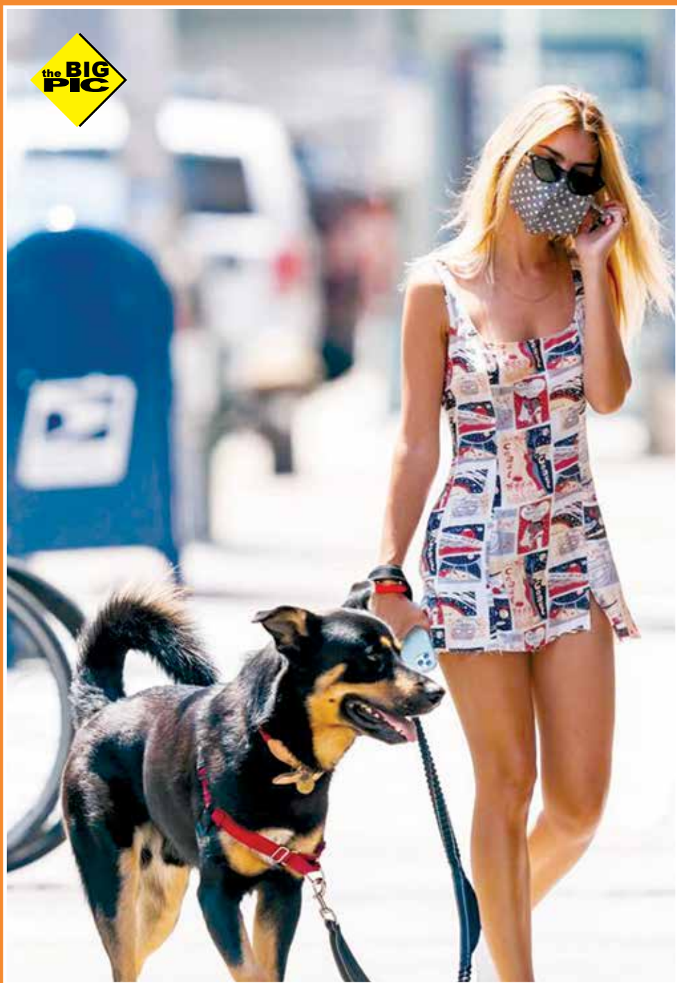
CITY STROLL! The model, Emily Ratajowski takes a call while out walking her dog in a summer dress and white sneakers in NYC.