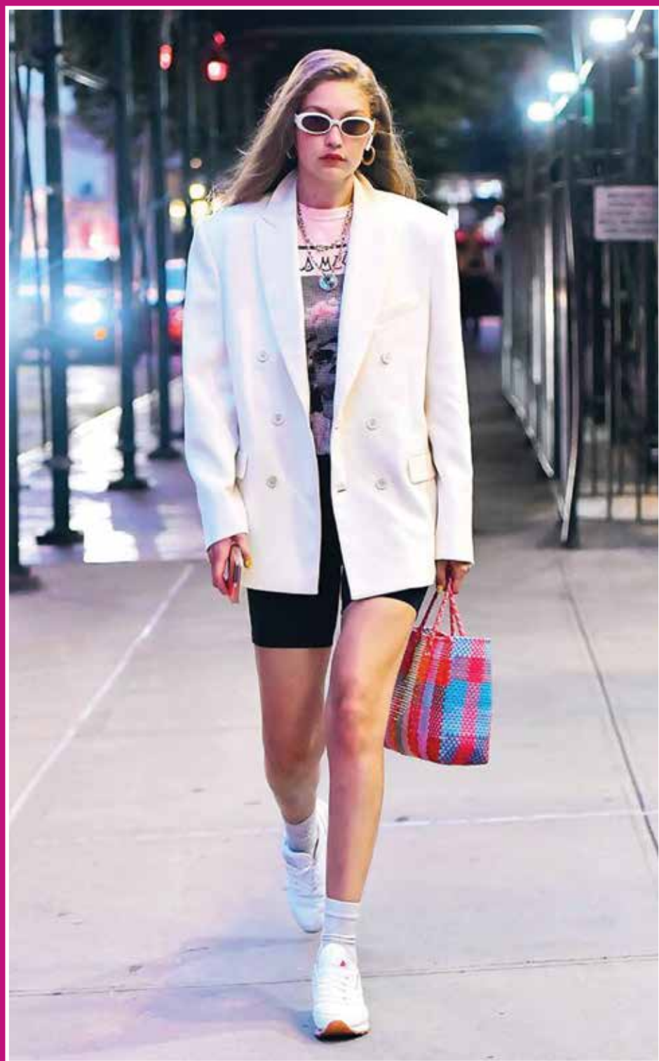
Strut in style! The model, Gigi Hadid was spotted looking very stylish and fashionable while out & about in New York City.