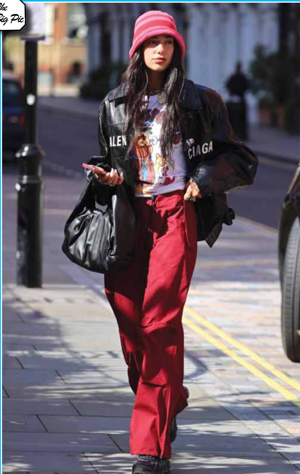
BUCKET HAT BABE! The songstress, Dua Lipa shows off her cool fashion sense while around town in London.