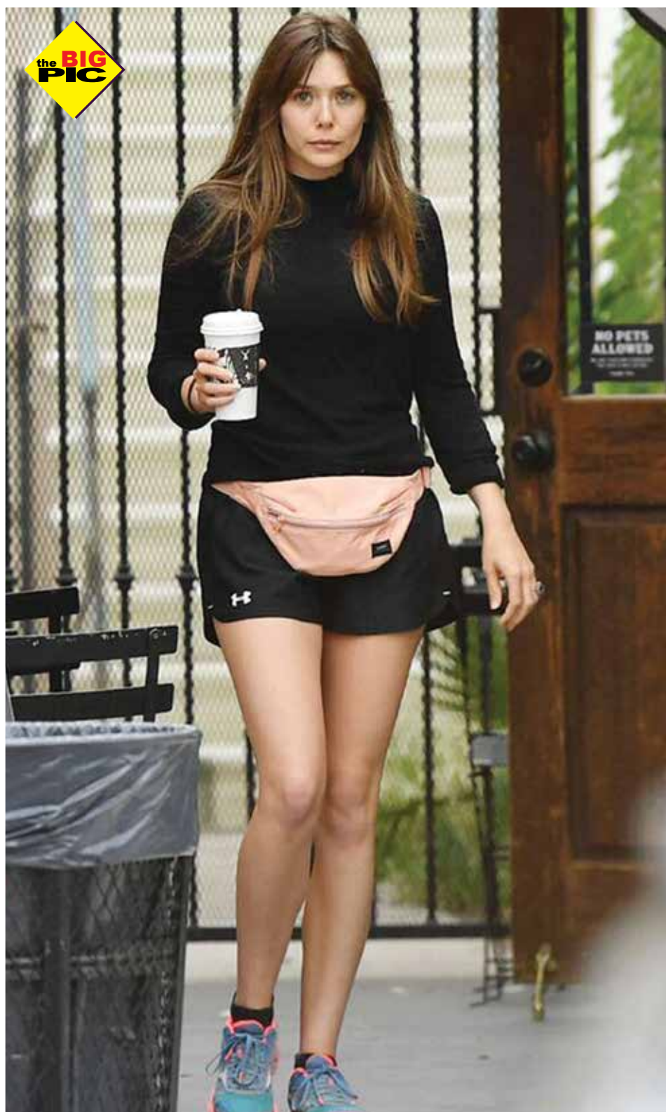
SPOTTED! The Avengers actress, Elizabeth Olsen was spotted going on a hike while wearing her new engagement ring in the Hollywood Hills.