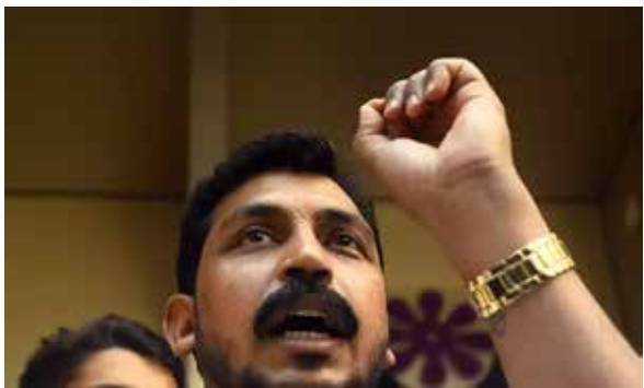
Chief Minister Nitin Patel visited the village.

Following the incident, tensions ran high in the area and Deputy