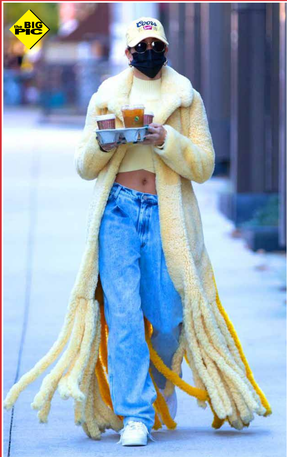
COFFEE RUN! The model, Hailey Baldwin Bieber wears a fuzzy yellow coat while picking up some drinks in Brooklyn.