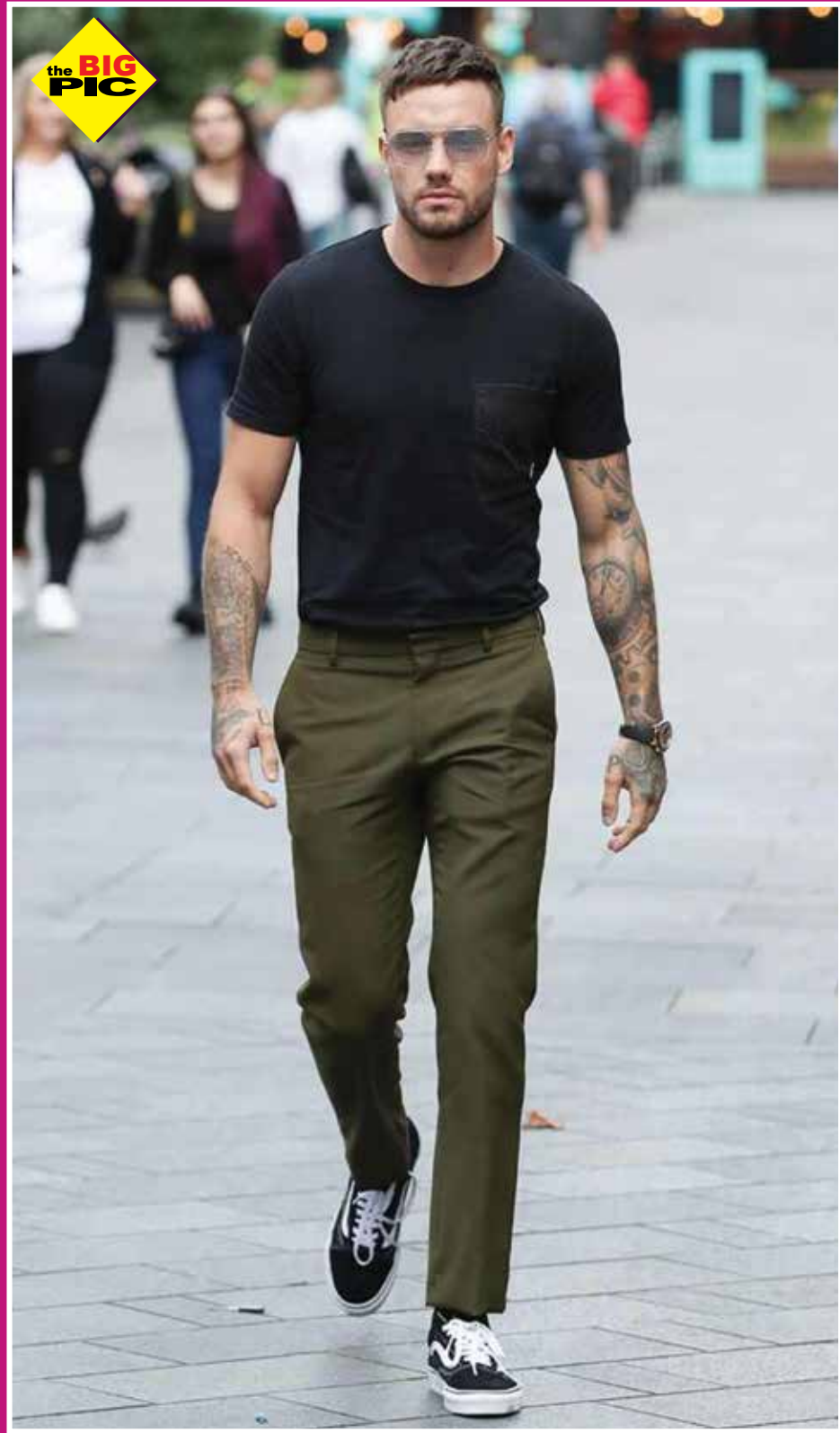
STROLLING THROUGH! The musician, Liam Payne sports a casual tee with green slacks and black sneakers while out in London.