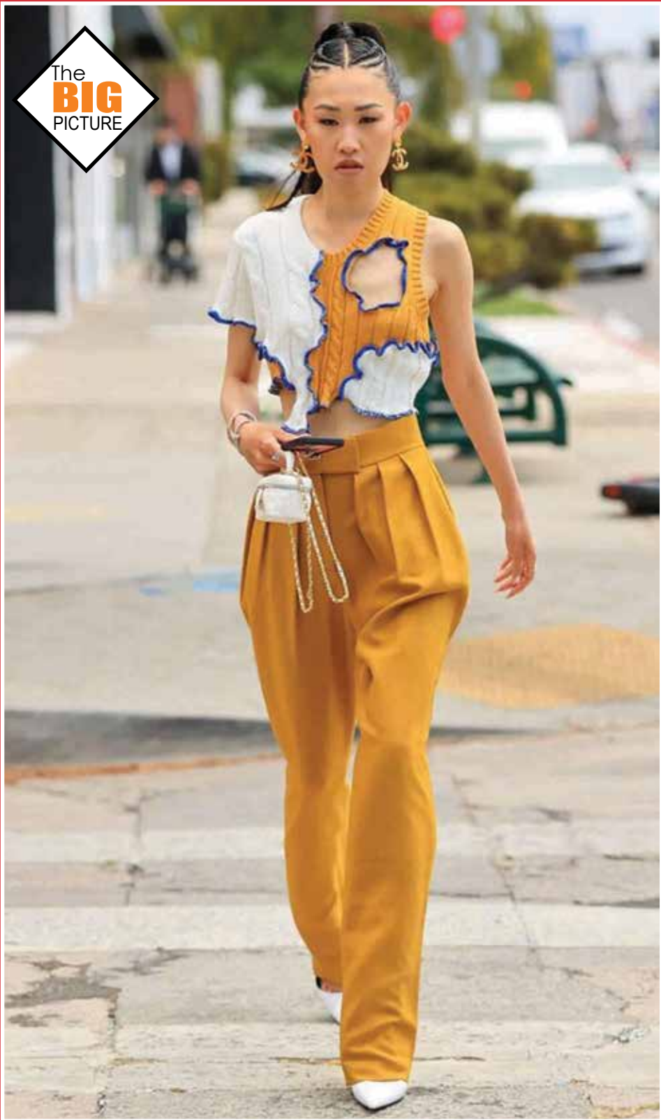
POWER WALK! The Bling Empire star, Jaime Xie looks super stylish while heading to a meeting in Los Angeles.