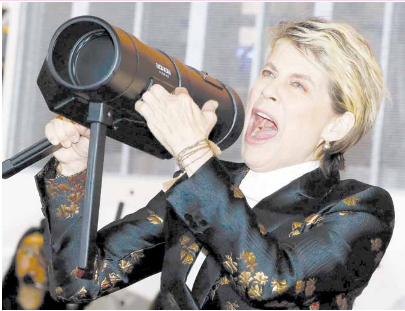
SHE'S BACK! Actress, Linda Hamilton posed with a movie prop at the premiere of Terminator: Dark Fate at the IFC mall in Seoul, South Korea.