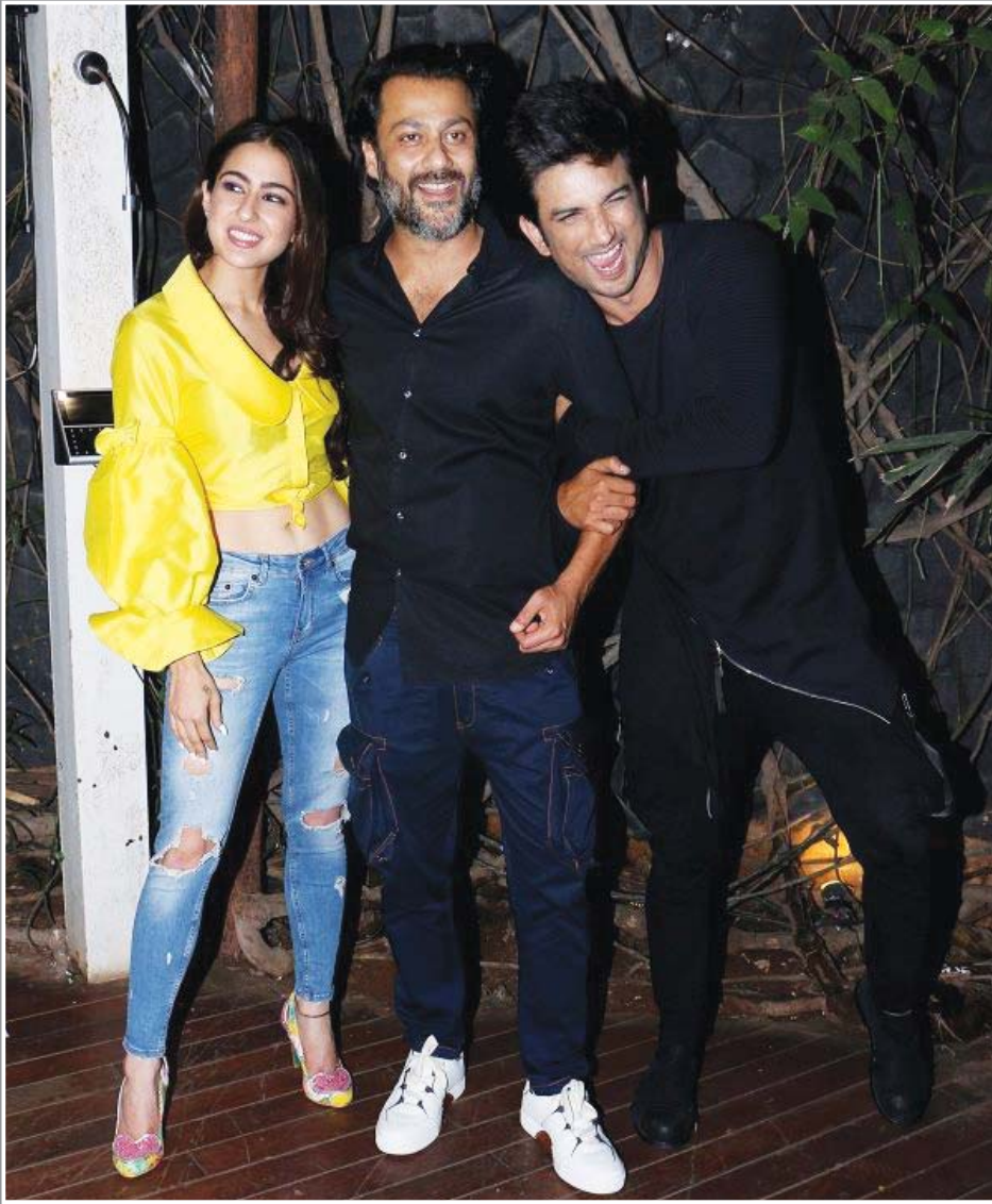
LET'S CELEBRATE! Sara Ali Khan and Sushant Singh Rajput partied last night to celebrate the wrap of their upcoming film Kedarnath with director, Abhishek Kapoor.