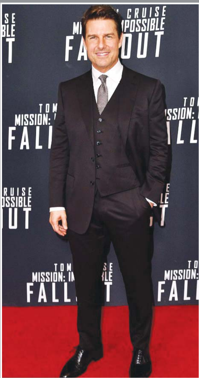
PREMIERE NIGHT! MISSION: Impossible- Fallout star Tom Cruise looked dapper in a three-piece black suit as he showed up to the latest Mission: Impossible film's premiere and screening at the Smithsonian National Air and Space Museum in Washington DC solo.