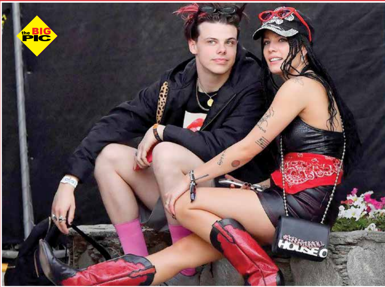
YUNG LUV! THE SINGERS, HALSEY & YUNGBLUD WERE SPOTTED PACKING ON THE PDA AT COACHELLA.