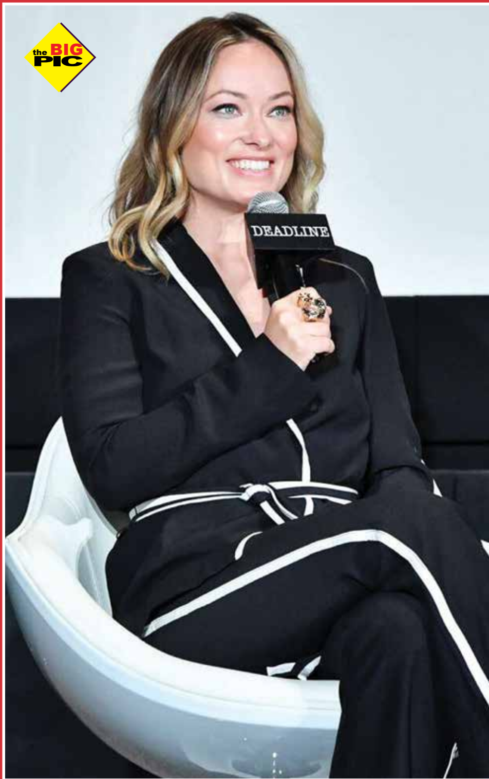
WILDE ON STAGE! ! The actress, Olivia Wilde is all smiles during a panel at the DGA Theater in New York City.