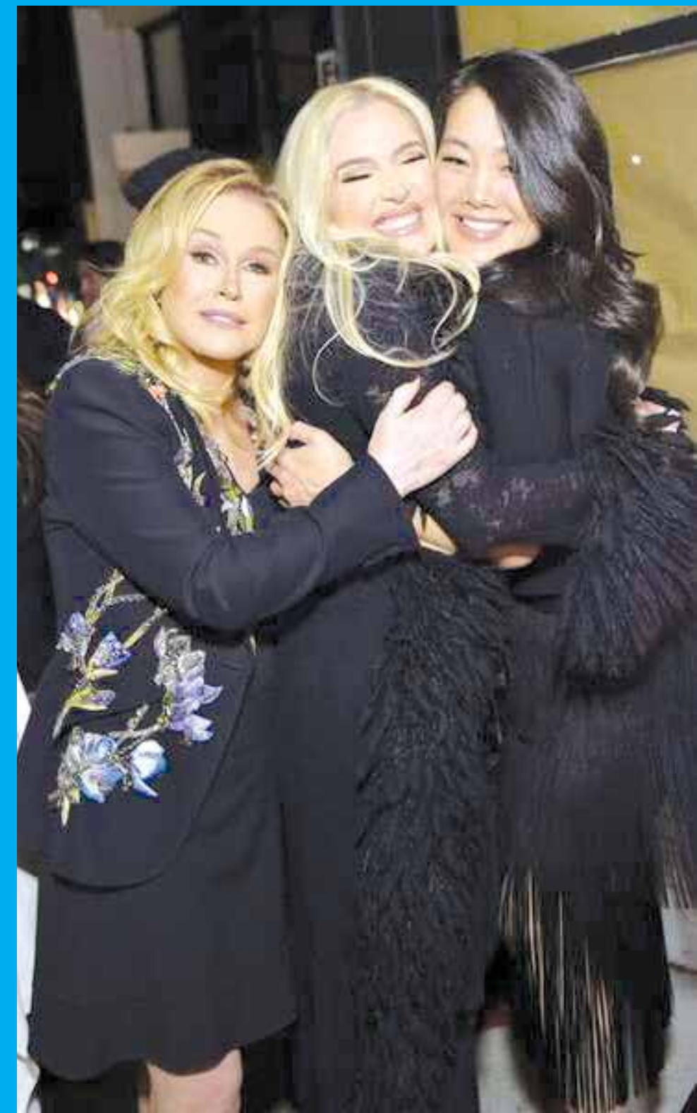
BIRTHDAY HUG! The Real Housewives of Beverly Hills - Kathy Hilton, Erika Jayne & Crystal Kung Minkoff - celebrate Kathy Hilton's birthday at Mr. Chow in Beverly Hills.

Reality check, Pisces: you are only living a percentage of your potential. There is so much you're yet to explore within yourself. The cards are urging you to stop playing small, take a deep dive and own the gifts that were given to you at birth. For some of you, this may be a time of stepping into a bigger role. Let 'lead by example' become your mantra, wild one.