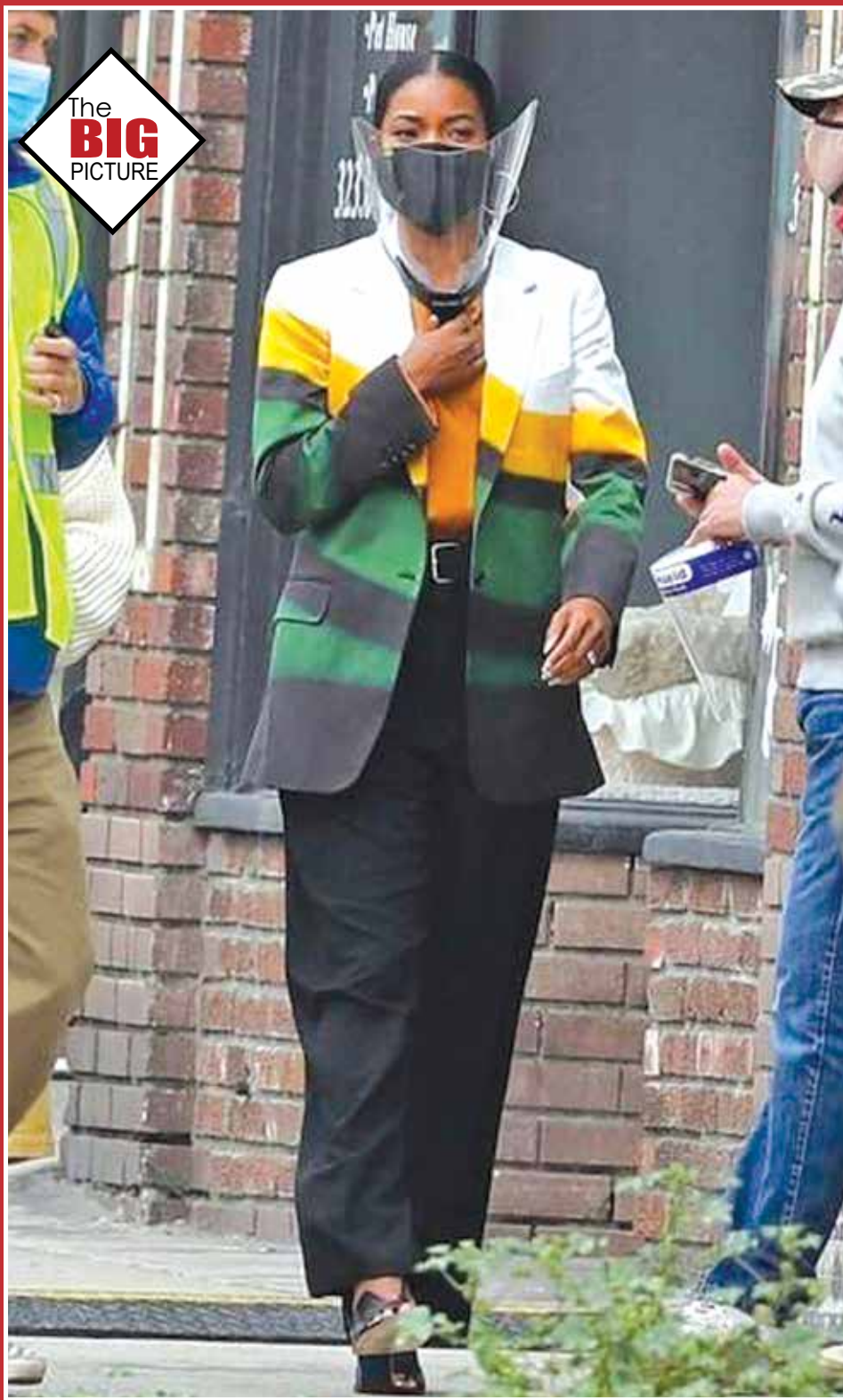
BEHIND THE SCENES! Actress Gabrielle Union is spotted on the set of the newest version of Cheaper by the Dozen in Los Angeles.