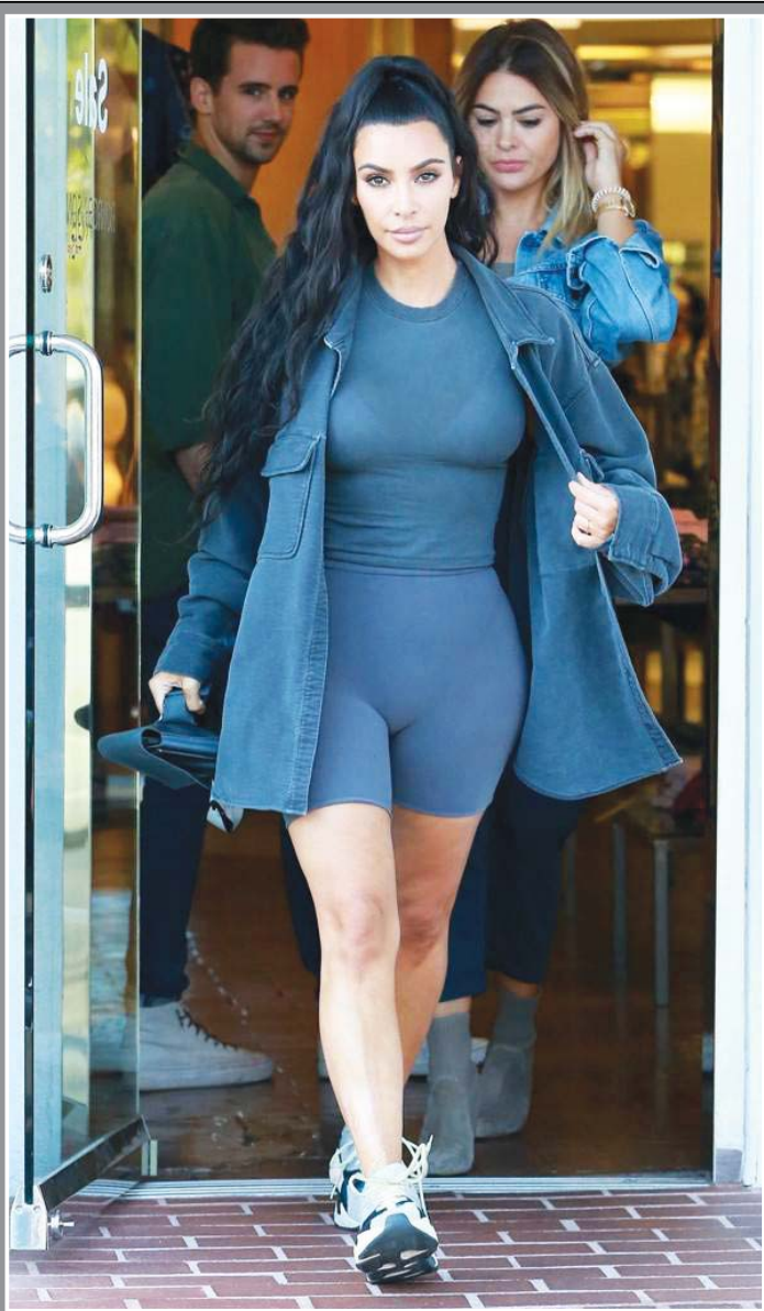
COMFORTABLE AND COOL! Beauty mogul and reality star Kim Kardashian was spotted doing some shopping in West Hollywood.