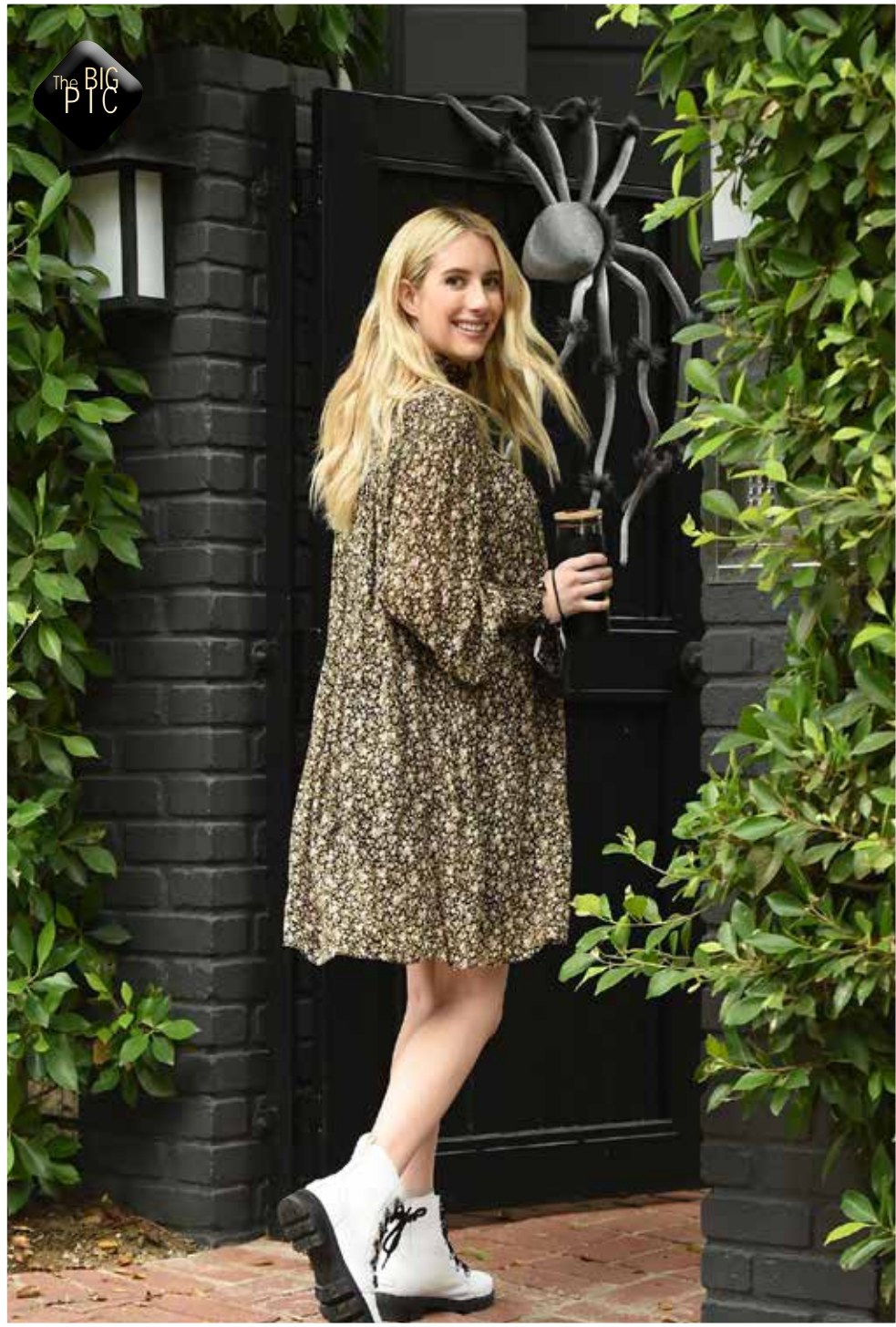
FLOWER POWER! Pregnant Emma Roberts glowed in a flower-print dress and SOREL's Lennox Lace Boot while out in L.A.