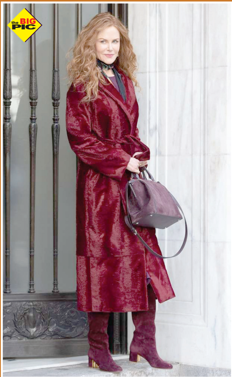
BEHIND THE SCENES! Nicole Kidman looks ravishing in a red coat and boots while filming The Undoing in NYC.